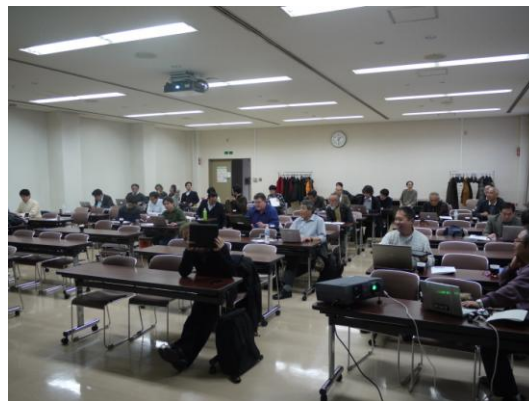
Fig.2 One of the ICC-IMR workshops of this project held in IMR. Roles of polarised neutrons for advanced materials were discussed with leading scientists of neutron science.